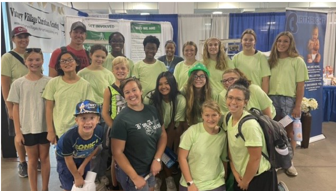
At the Victory Village booth in the Meadowlark Building

In Kansas, September means the State Fair. This year the girls went on an educational field trip to the Kansas State Fair here in Hutchinson. They did a lot of walking, learning about various things throughout the day, and saw some animals too.