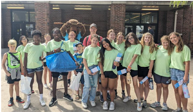
The Fairgrounds covers a big area with a lot of buildings, so there was a lot of walking from one place to another.