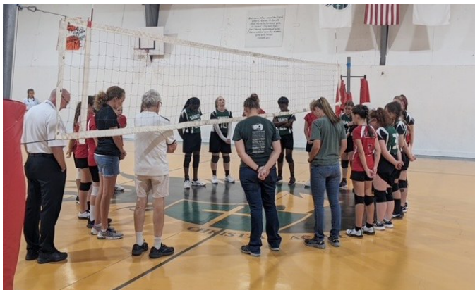
The Volleyball season is in full swing. Here is a picture of prayer time with the opposing team before the game started. The team has multiple games and a tournament coming in September and October.

Fall is almost here. Check back next month on more exciting things the girls are doing and learning. Thank you to each of you for your continued love, prayers and support. God has big plans for each of these girls.