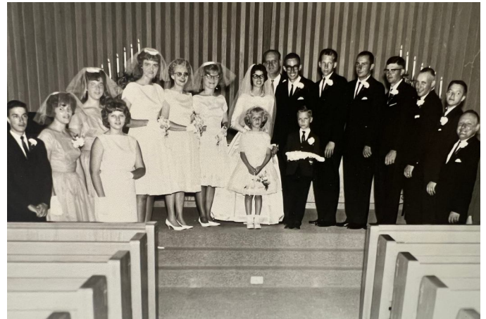
First Covenant Church, Salina, KS, July 7, 1963 – 200 Guests.