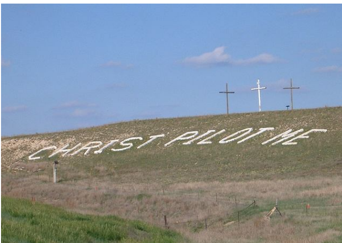
The Christ Pilot Me Hill on Highway 96 in Ness County

The Newsletter is printed by Taylor Printing, Pratt, Kansas