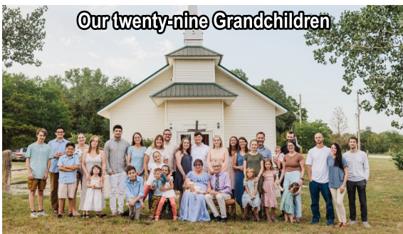
Our twenty-nine Grandchildren