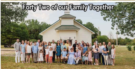
Forty Two of our Family Together