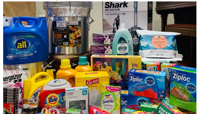
Here are the supplies the Silver Lake people collected and brought to the game in Manhattan for Victory Village.

They were treated following the game. A good sized group from First Baptist Church of Silver Lake traveled to Manhattan to watch the game. Pastor Deron Johnson and the people of First Baptist are very generous to Victory Village with monetary support, and with their response to our needs list.