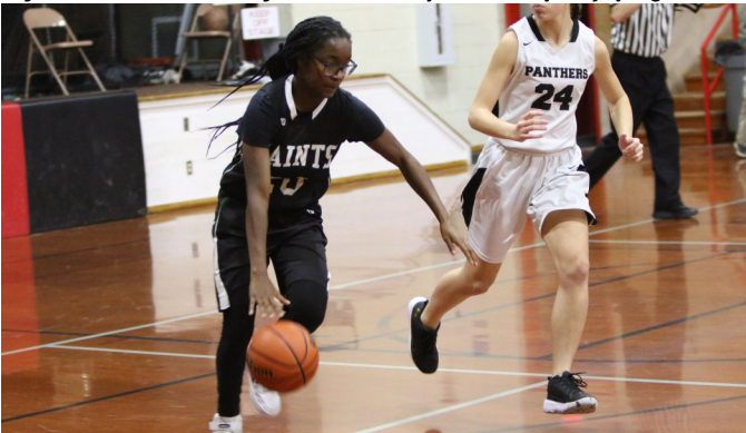
The VVCA Basketball Team has another full month of games and finish their season at the end of February