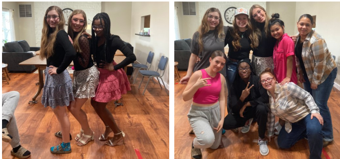
A Fun Fashion Show the girls did at the Dorm