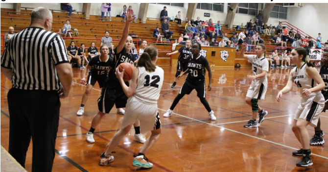
VVCA Saints playing the Newton Panthers at Moundridge

The girls are busy as ever in school. This semester for electives there is Horticulture, Dance, Theatre, Woodworking and Art. We have added "H.A.D. Time" to the girls' activities during the weekend. H.A.D. stands for Hobbies and Drinks. The girls were given a few choices of which hobby they would like to participate in each Saturday for a time.(more on page 2)